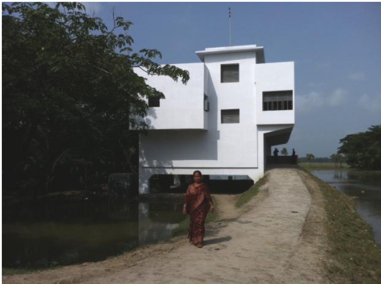
Sonatola II frontview