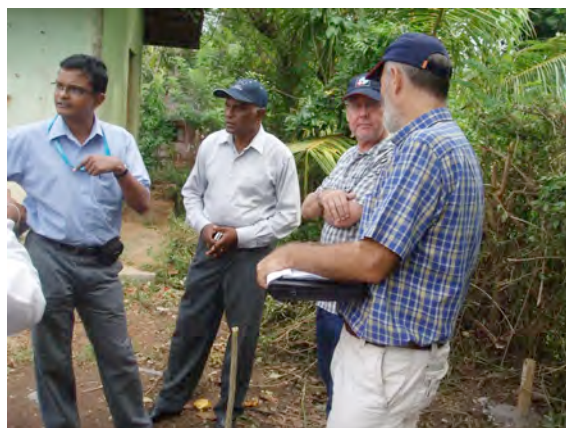
We have to demolish the old house!