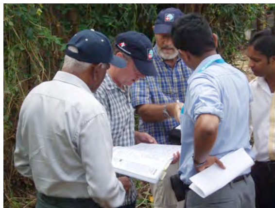
With the UNICEF team