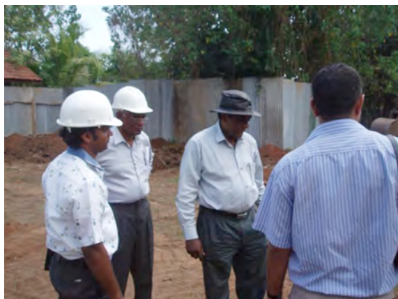
First meeting with contractor on site