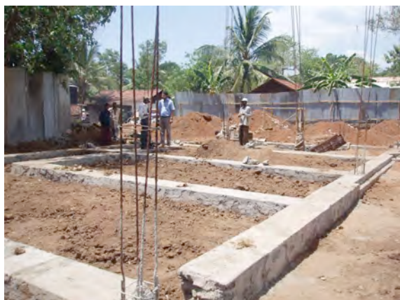
Foundation of ground floor