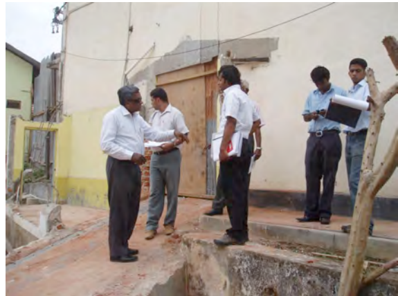
Team meeting with Consultant and Contractor