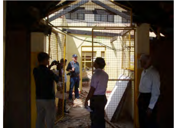
Demolition of the previous building