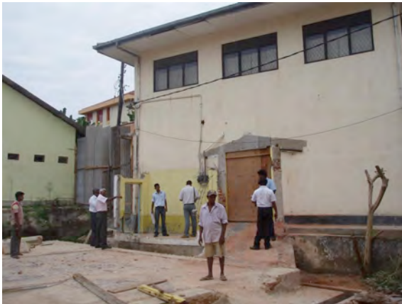
After the demolition