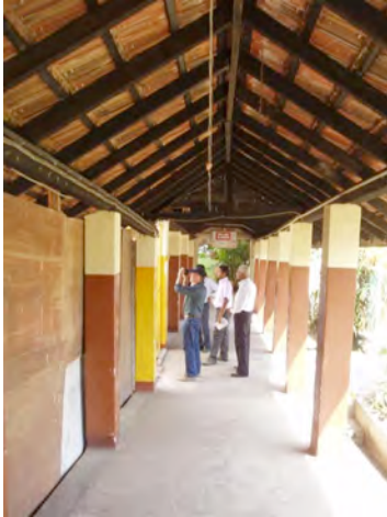
First meeting UNICEF CMU-Team with Contractor