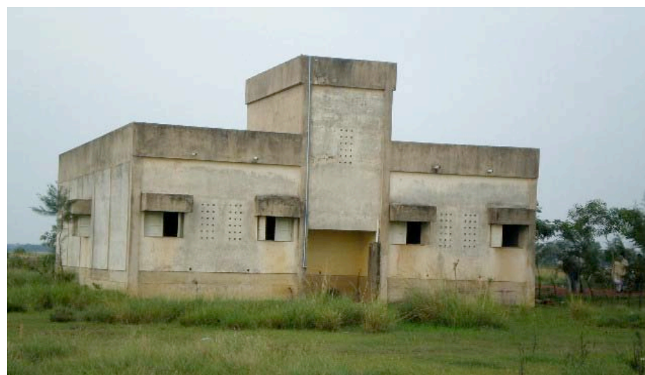
Shelter on a raised platform in areas prone to low level floods