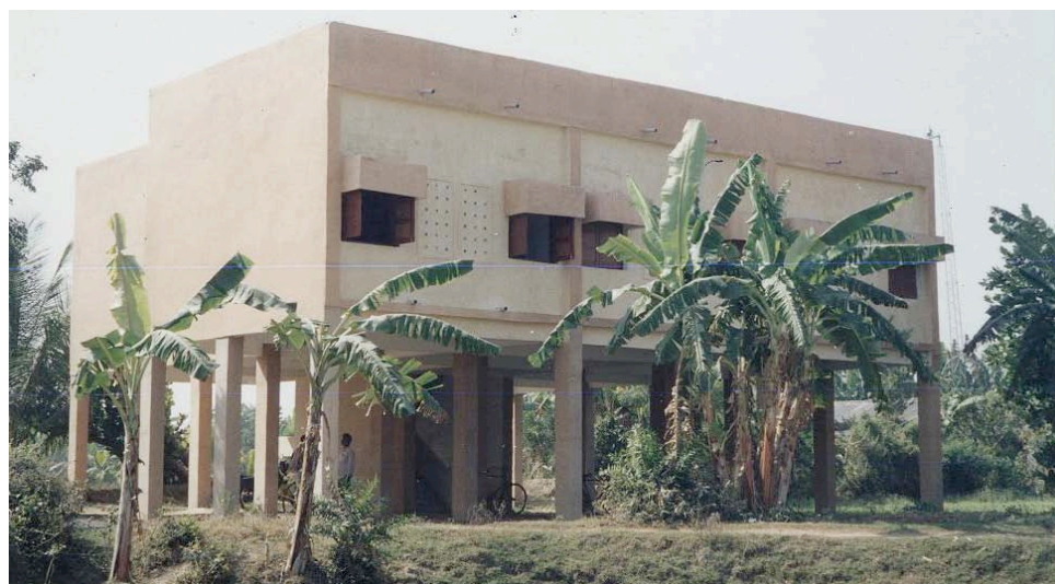
Stilted shelter design option for highly flood prone areas